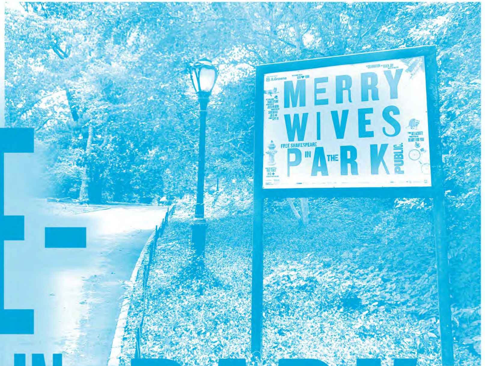
Pictured: The path to FREE SHAKESPEARE IN THE PARK