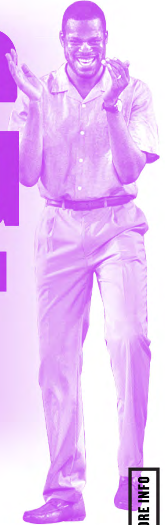
Pictured: Cast members in MERRY WIVES